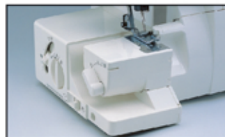
Free Arm/Flat Bed Convertible Sewing Surface