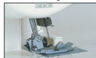
Uses Home Sewing Machine Needles