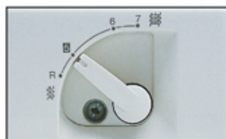
Convenient Stitch Width Control