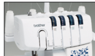
Quick Lay-in Threading