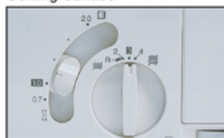
Outside Differential Feed Control