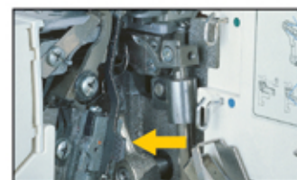
Easy to Remove Stitch Finger for Narrow/Rolled Edge