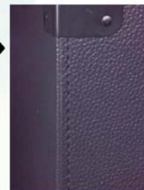
Extra Reinforcing Stitches