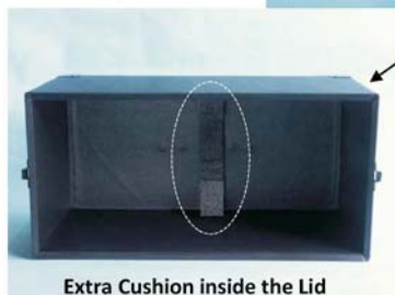
Extra Cushion inside the Lid