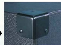
Metal Corner Supports